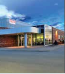
CANADA TECHNOLOGY CENTRE