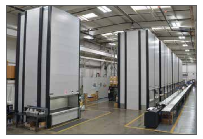
Fully automated warehouse storage systems ensure the fastest delivery of Mazak spare parts